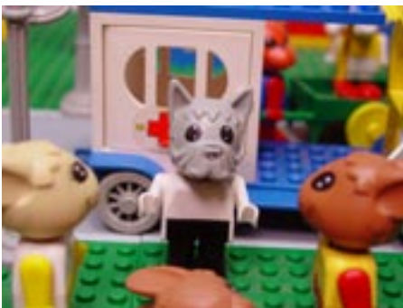
Betsy Bunny, Doctor Dalton Dog, and Randy Rabbit look over a fallen stranger