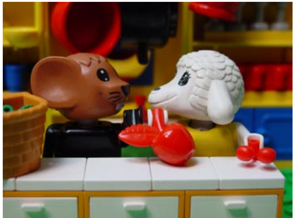
Marcus Mouse and Lily Lamb share a quiet moment...or do they?