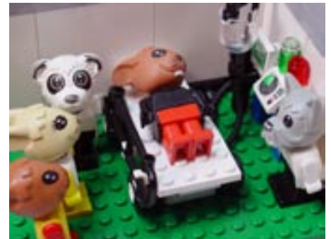
Randy Rabbit, Betsy Bunny, Doctor Paco Panda, and Doctor Dalton Dog, check over the fallen stranger,,but who is he?