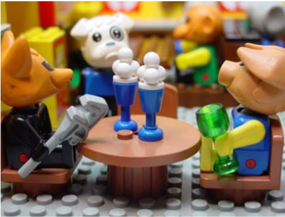
Officer Brody Bulldog encounter Fenix Fox and Peyton Pig