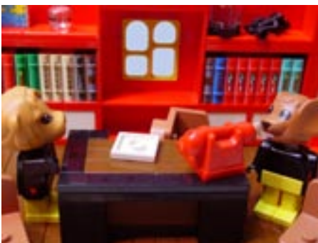
Mayor Langston Lion and Marcus Mouse discuss the front page of The Fabuland Gazette ...and why the mayor is not on it

with Exo-Force for no good reason. It's like there's subliminal advertising for it or an addictive substance lining the manual of each set. I don't know, maybe it's the fact that there's a story line or maybe I like blue hairpieces. Who knows? Exo-Force =cool!